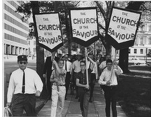
Marchers from The Church of the Savior, on the day of the March on Washington for Jobs and Freedom

We might expect that this fountain of outreach and service flows from a constant emphasis on serving others, a curriculum of recognizing needs and best practices for solving them. But that’s not quite the truth.